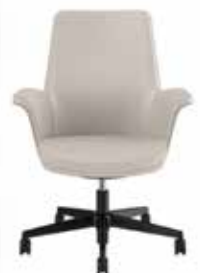
Humanscale® Summa Chair