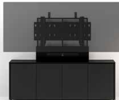
D1/347/M1H3 Siena Black Oak with Jupiter Pana 105"

All pieces are built to order, manufactured in the USA and backed by a Lifetime Warranty. Customize your own by selecting from our wide variety of styles, materials, sizes and finishes of furniture to support technology, unified communication and maximum user engagement with designer style.