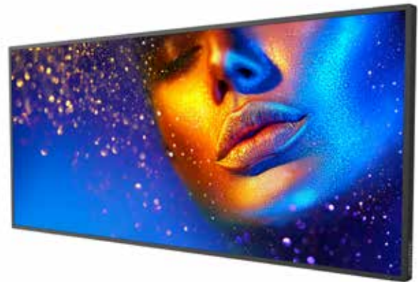
Jupiter Pana's 21:9 ultra-wide 5K (Pana 105")

We believe that 21:9 ultra-wide 5K LCD are the future for enterprise and are committed to leading the way in this space. The Pana is fully engineered and designed from the ground up by Jupiter; this allows us to work with market leaders such as Microsoft to create a fully integrated Signature Teams Room display and solution. Jupiter Pana displays are installed at over 50 Fortune 500 companies in over 22 countries (and growing), many in the Microsoft Signature Front Row MTR configuration.