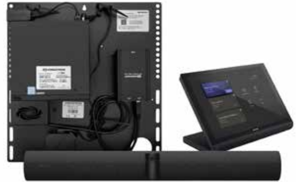
Crestron Flex Small Room Conference System (UC-B31-T)

The UC-B31-T Crestron Flex tabletop conferencing system provides a small room video conference solution for use with Microsoft Teams® Rooms software. It supports single or dual video displays 1 (not included) and features a tabletop touch screen, Jabra® PanaCast 50 video bar, UC bracket assembly, PoE injector, and cables.